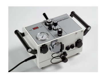
All connections at the back panel of the hydraulic unit