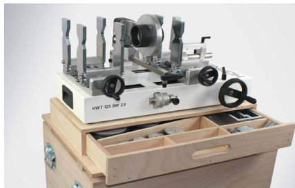
Wooden transport and set-up box