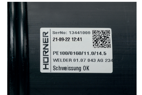
Tag printer and label tags

Immediate quality labeling of every welded joint is possible with the optional dedicated tag printer that delivers an abrasion-proof plastic sticker which can be used as a label on the fitting or joint.